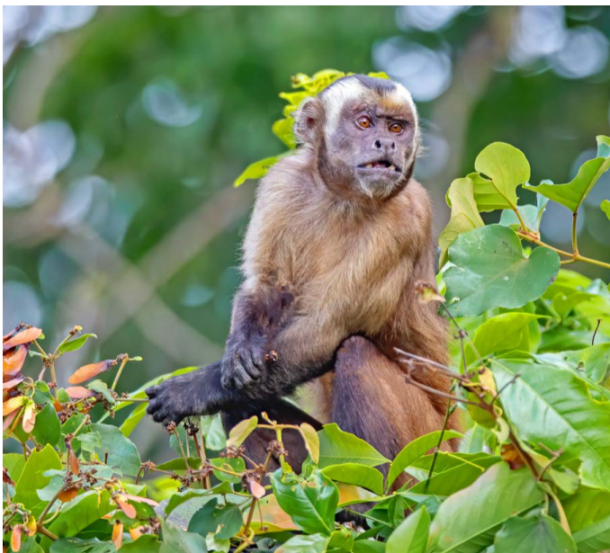
Large-headed Capuchin Monkey

To protect the endangered wildlife and tree species that live on our lands, we must have a constant presence of forest guardians living there. Your support is critical to helping us keep out invaders and expanding the land in our care.